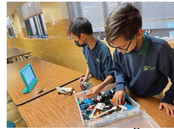
Chromebooks in 2nd – 8th grade

Interactive boards in every classroom and technology lab classes for all students