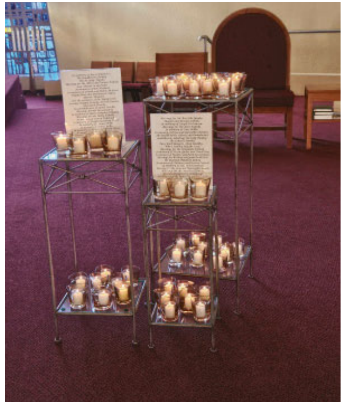
Intentions for loved ones were offered at the Mass on the morning of the annual Golf Outing.