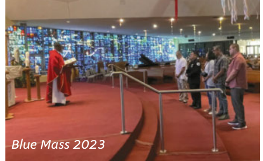
Blue Mass 2023

All first responders, currently active or retired, and their families are invited to celebrate a Blue Mass with our parish on Sunday, May 19 at St. Cyprian at 9 AM. The Mass is an opportunity for the community to show gratitude to first responders and their families.