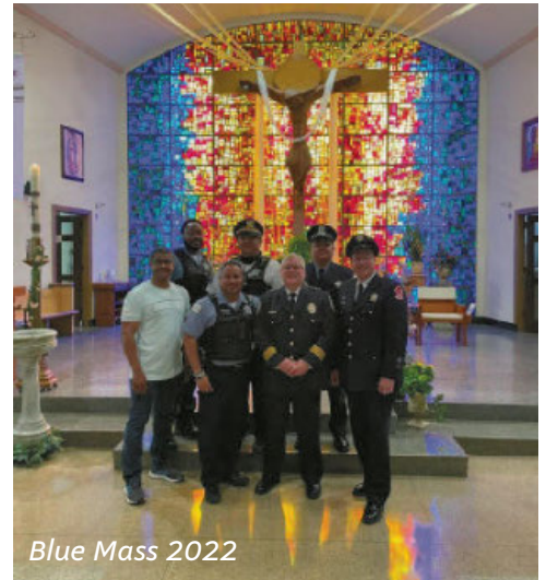
Blue Mass 2022